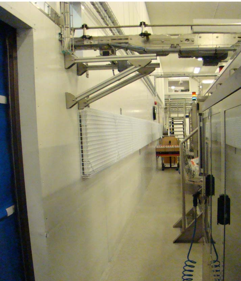
Figure 9. Hygiene Advance Protection C3 on the wall close to noisy machinery.

To reduce the noise levels at especially exposed locations, wall panels were also mounted as close to the noise sources as possible. Such a location was the “corridor” between the machinery and wall as shown in figure 9. The panels were mounted at head height.