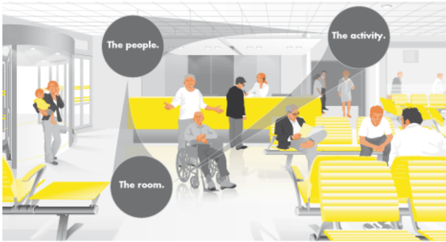
Figure 1. Room Acoustic Comfort™, acoustic design approach considering the interaction between the people, the activity and the room.