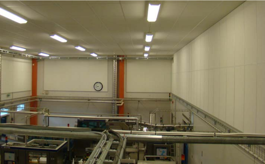
Figure 8. Acoustic treatment of ceiling and walls in Oatly's factory.

To reduce the noise levels at especially exposed locations, wall panels were also mounted as close to the noise sources as possible. Such a location was the “corridor” between the machinery and wall as shown in figure 9. The panels were mounted at head height.