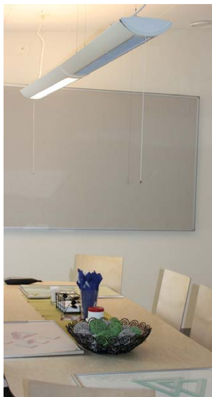
Figure 6. Wall panel: Ecophon Wall Panel C/Texona

The practical absorption coefficients for Ecophon Master B ceiling absorber and Ecophon Wall Panel C/Texona are identical. The absorption graph is shown in figure 7.