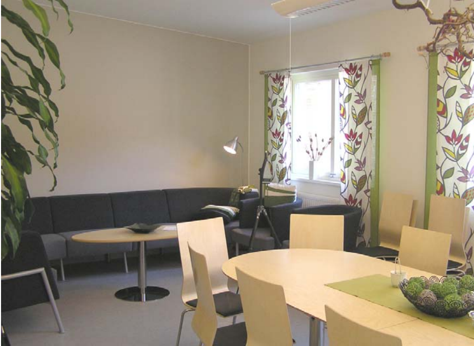
Figure 4. Dining and meeting room at Landskrona Hospital before refurbishment.

The room is used as a dining and meeting room for the staff of the medical emergency department at Landskrona Hospital. The volume of the room is 69 m 3 with a floor area of 25 m 2 . Both ceiling and walls consist of plasterboard without any acoustical treatment. The room before refurbishment is shown in figure 4.