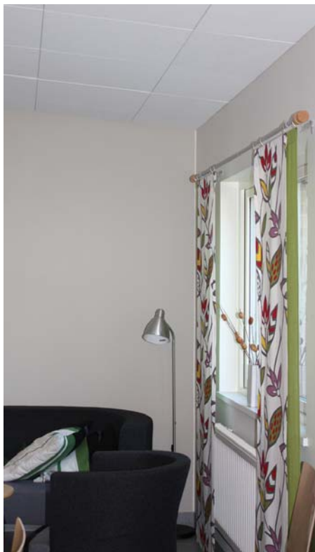
Figure 5. Ceiling absorber: Ecophon Master B