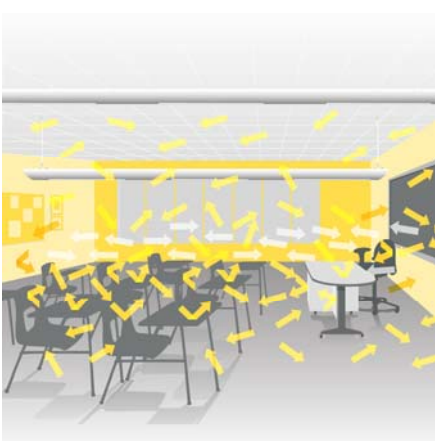
Figure 2. Sound field at steady state in a room with suspended ceiling and sound scattering objects.

The reverberation time is measured by shutting off the sound source and measuring the time for the sound pressure level to decline by 60 dB. As the sound energy decays, the diffusivity of the sound field will not be maintained. During the decay the sound waves that hit the most absorbent surface, in this case the ceiling, will disappear first, while sound waves that hit hard surfaces that reflect sounds, in this case the surrounding walls, will persist for longer. In fact, in many rooms with suspended ceilings the reverberation time is very much determined by these persistent sound waves travelling almost parallel to the ceiling. These waves are sometimes referred to as grazing waves since they hit the ceiling at a very grazing angle of incidence. By increasing the amount of furniture and sound scattering objects in the room the sound field becomes more diffuse during the decay. This also implies that in rooms with suspended ceilings the reverberation time is very much dependent on furniture and equipment in the rooms. The grazing sound field is illustrated in figure 3.